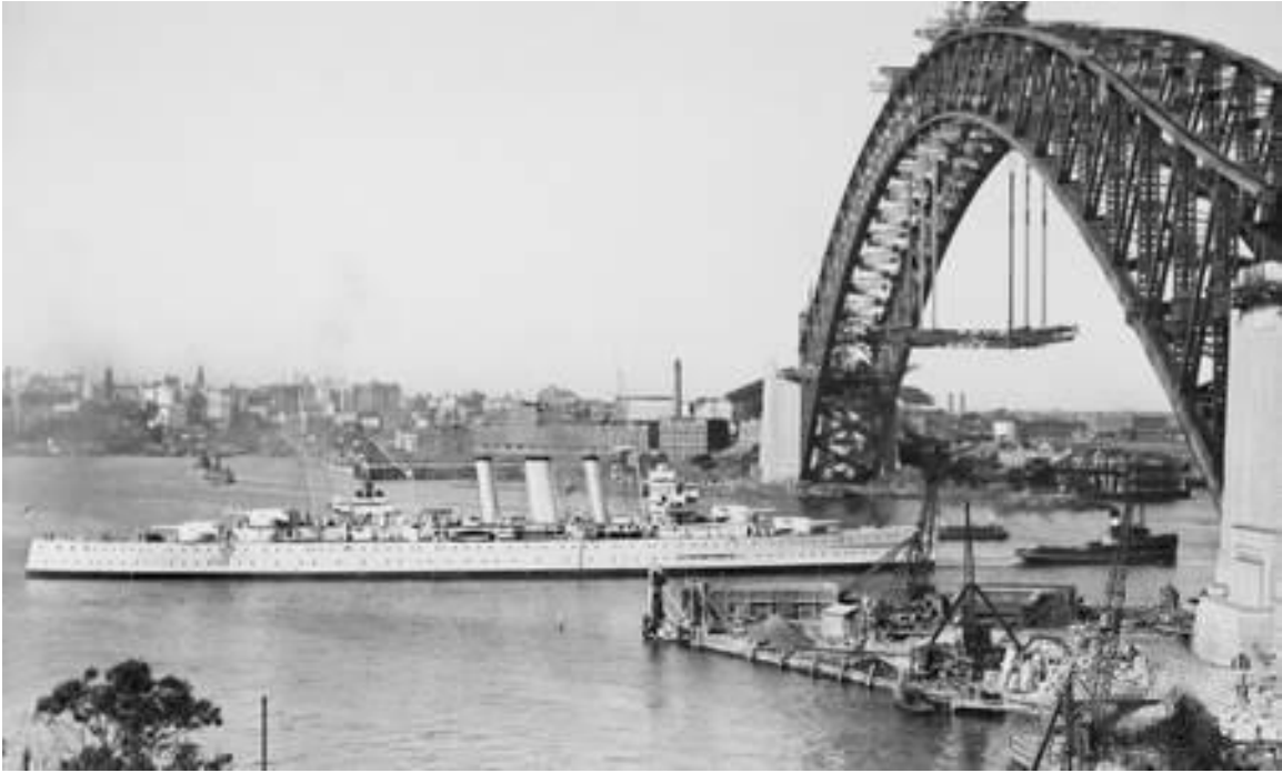
HMAS CANBERRA enroute to Cockatoo Island – Spaghetti Factory in background (a bit before Ernies time!)