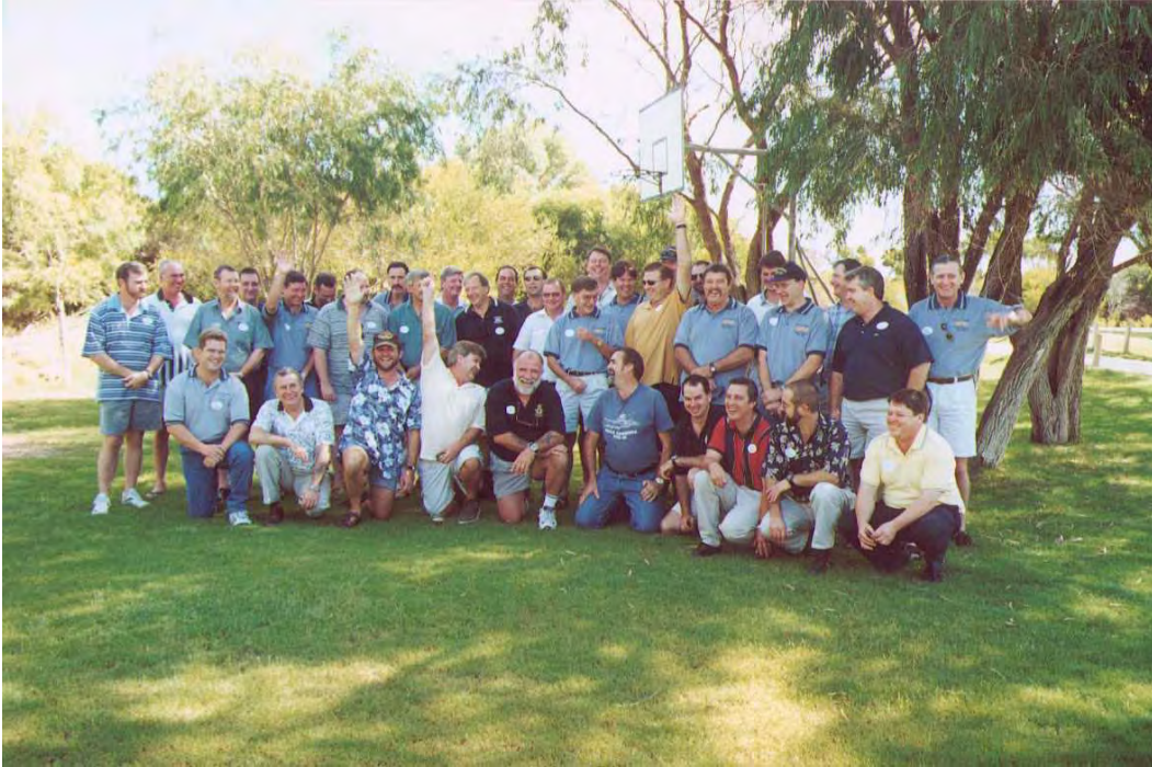
CANCOMCREW- FFG02 25 th Anniversary Reunion – mostly a bunch of scallywags