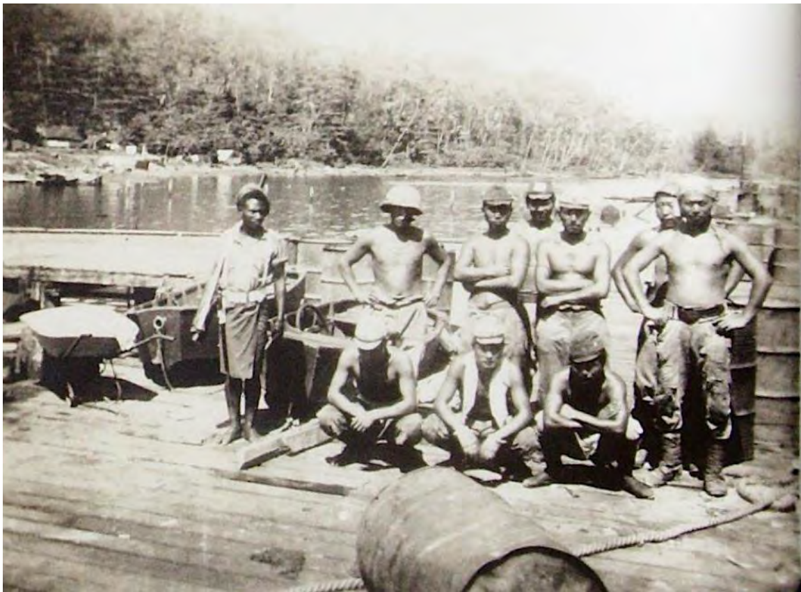
Well fed and fit Japanese POW working party Kokopo Rabaul 1946 with alert Islander sentry, cap „flat a“back“ in close proximity with .303 and sheafed bayonet