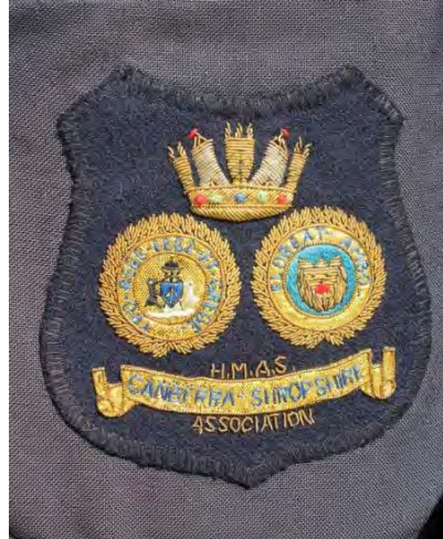
Bill Kynaston's blazer pocket