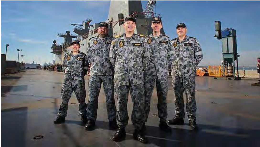
2013 Cancom 3 crew LHD 02 – alongside fitting out wharf Williamstown N.D.