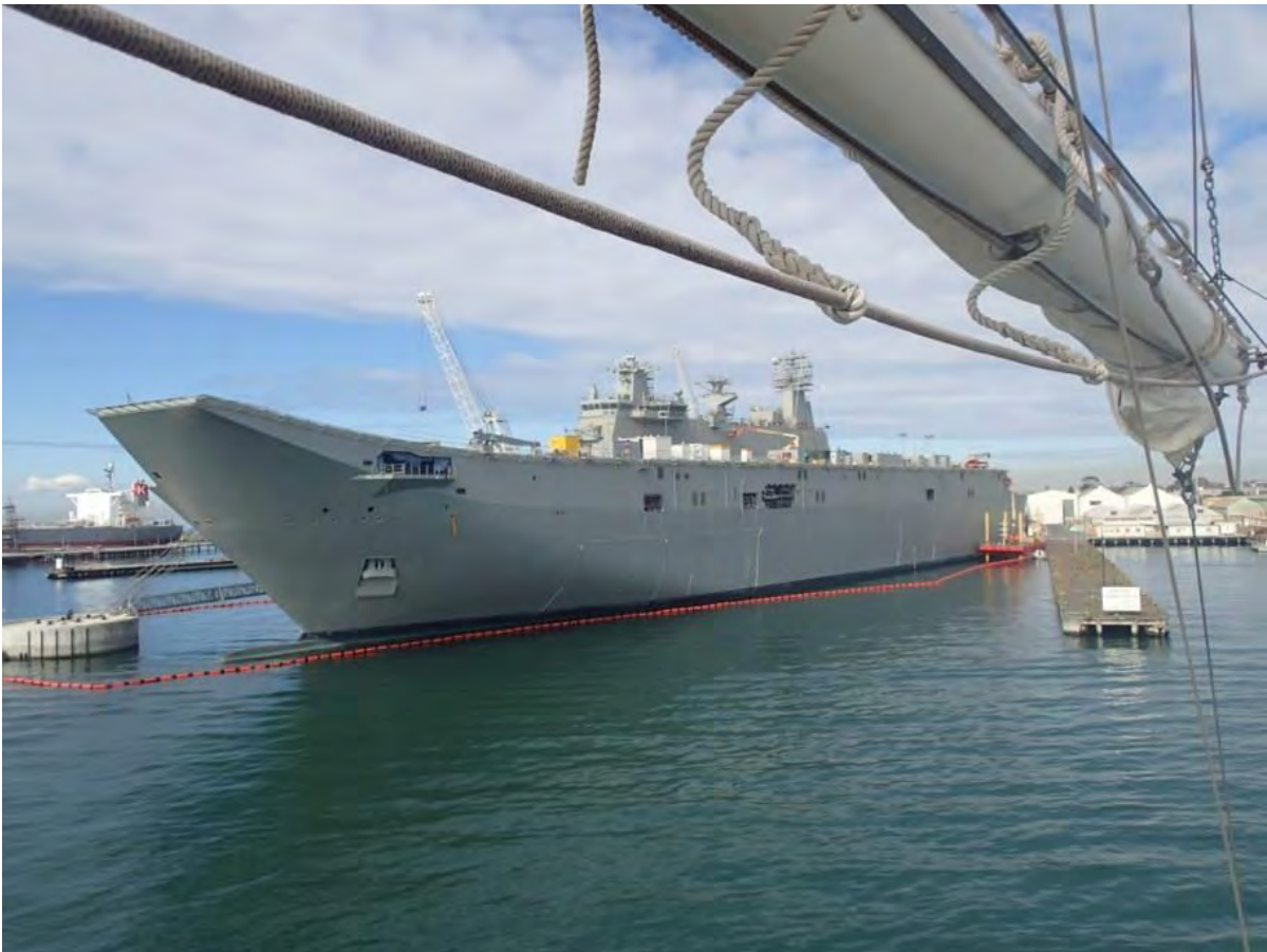
NUSHIP CANBERRA 3 fitting out at W.N.D Oct 2013