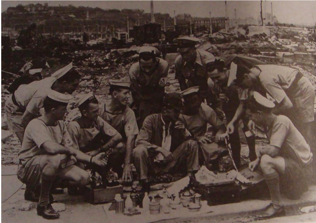
SHROPSHIRE crew Yokohama 1945 after Japans surrender, bargaining for „Rabbits“.